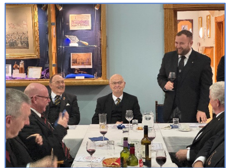
After the meal had ended the Worshipful Master thanked the Grand Master and the Provincial Grand Master for making this such a special day for the Brethren of the Court of Lenuri and presented them with a gift as a token of his appreciation.