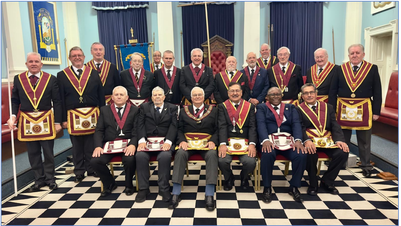
The Court was closed and after refreshments the brethren of The Rood at Sudtone Sari Court and their guests sat down to an enjoyable meal together at the Sutton Masonic Hall.