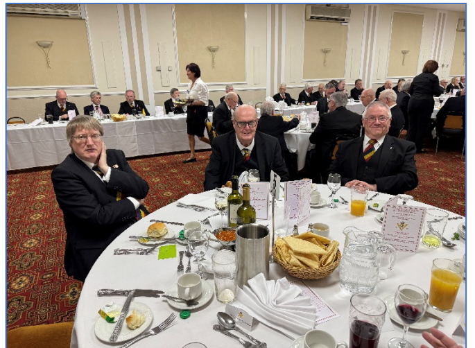
There was a most convivial atmosphere in the dining room. After lunch the Deputy District Grand Master in his toast to the District Grand Master presented him with a gift of cans of Irn Bru.