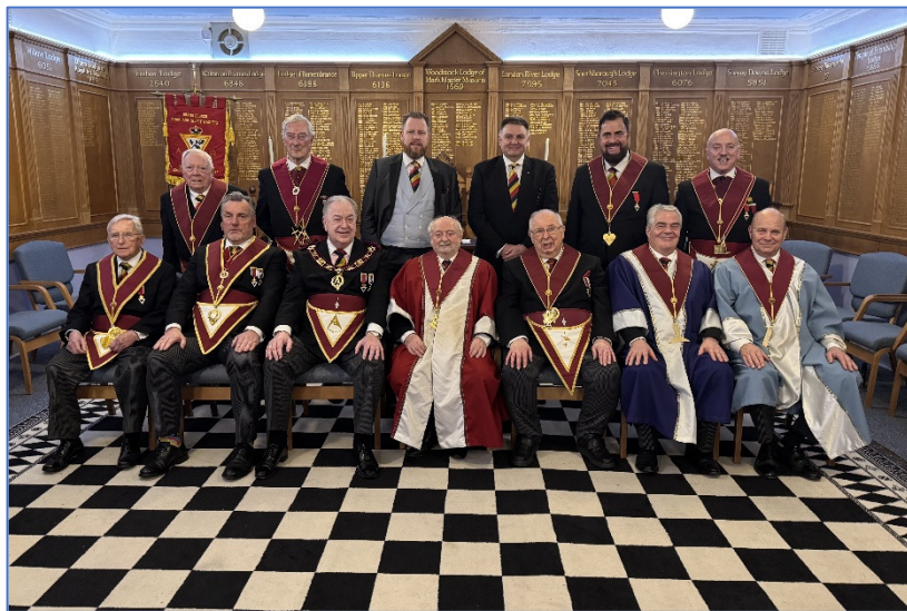
The council was then closed and the Thrice Illustrious Master accompanied by the District Grand Master retired from the Council.