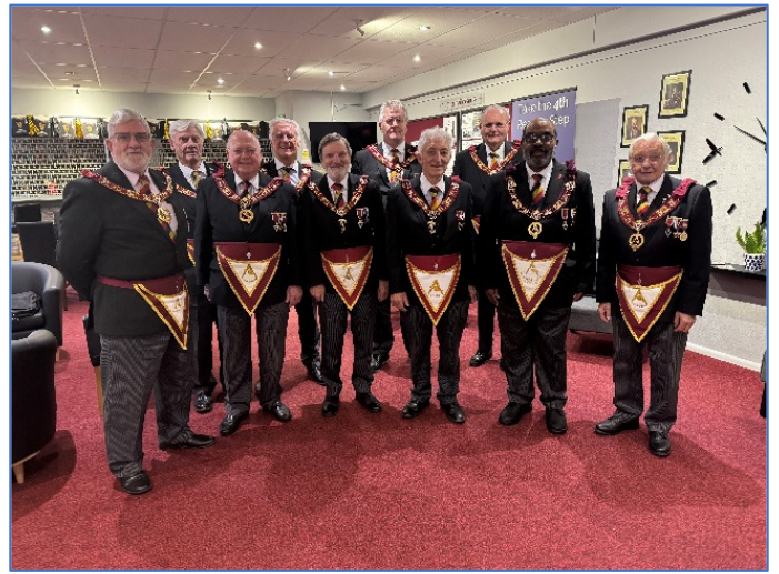
The Companions were called to Order to receive the District Grand Master who entered the Temple in procession, accompanied by the District Grand Officers of the Year.