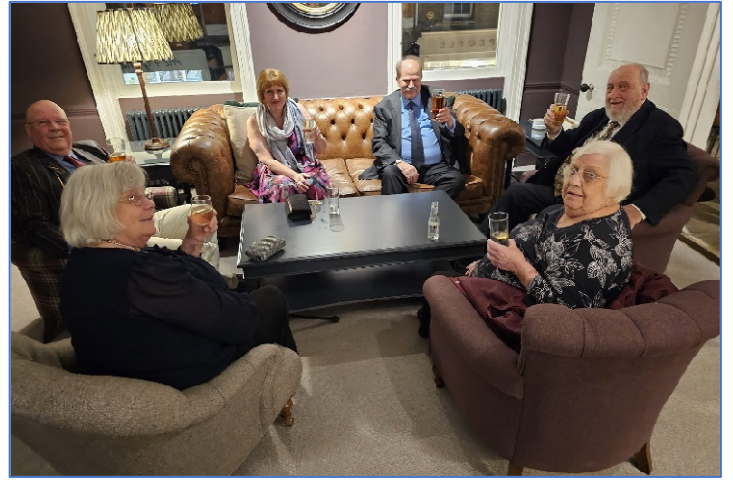
Conversation took the form of catching up with old friends, inevitable masonic chat and of course the rugby!

There are pleasant, cosy areas in which to sit and relax and open spaces for those wishing a more open environment.