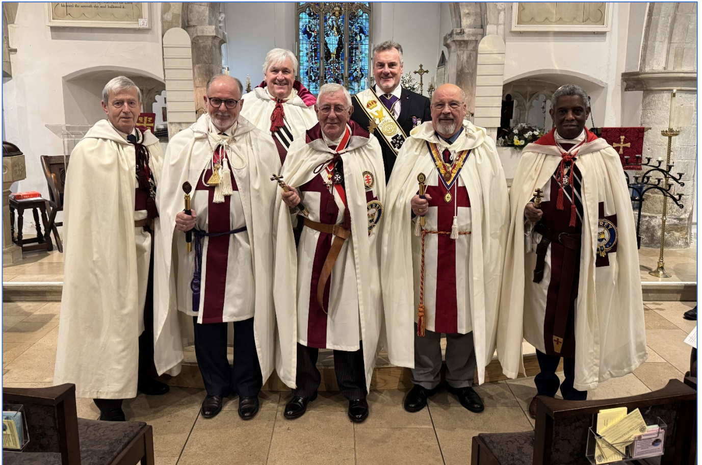
Members of the Companion Orders at the Provincial Priory of Surrey Church Service