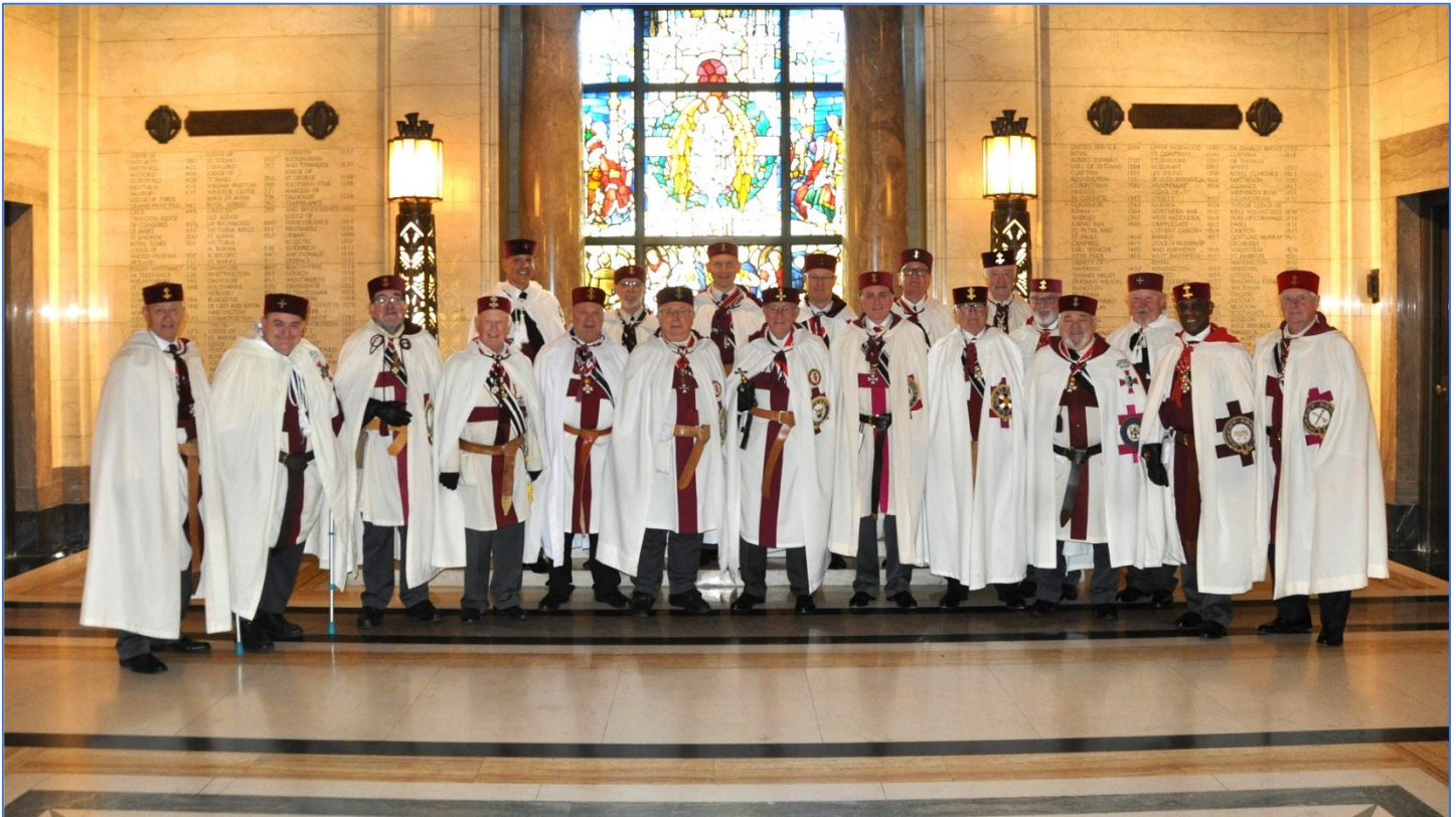
A splendid turnout of Surrey Knights to see our Provincial Prior Appointed, Obligated and Invested as a Knight Commander of the United Orders