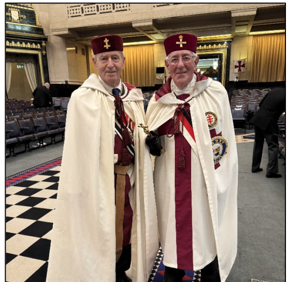
Our congratulations go to all those who received preferment this year, along with our thanks to all who attended and helped make this such a day to remember.