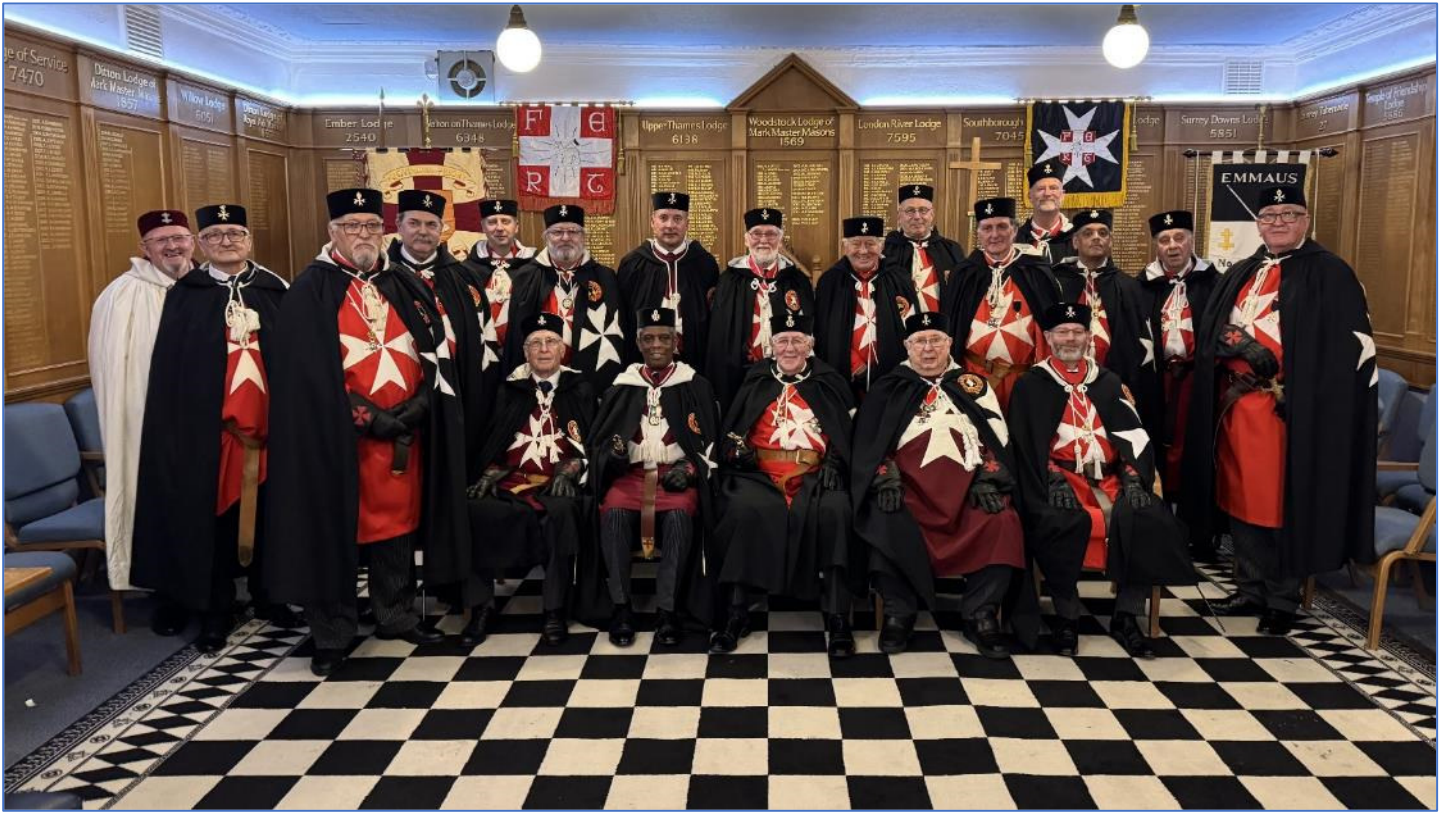
Afterwards the Brother Knights and their guests enjoyed a most convivial meal together at the Surbiton Masonic Hall.