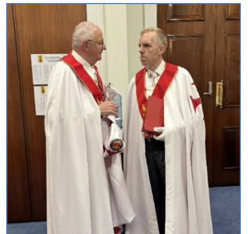
The Prefecture of St George of London was closed and the Most Eminent and Reverend Grand Master, the Deputy Grand Master, and Reverend Knights retired for refreshments while the Temple was being re-arranged for the meeting of Grand Priory.