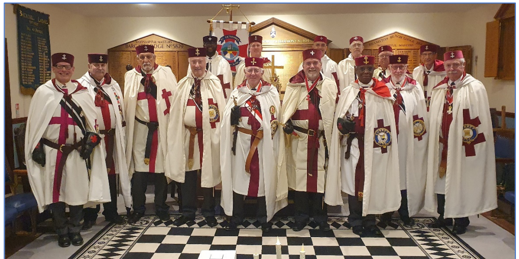
Thanks to Hugh Saville