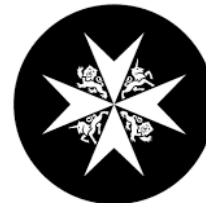
St John of Jerusalem Eye Hospital Group مستشفى سان جون للعيون