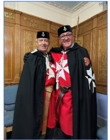
The Candidate was then congratulated and welcomed into the Order by the Provincial Sub Prior.

The Priory was closed and we all retired for refreshments in the bar.