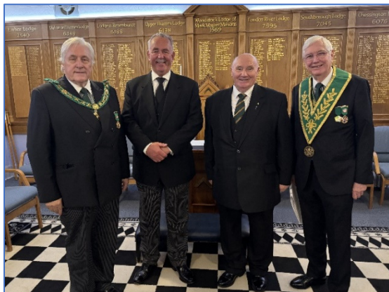
The photo above shows four RW Brethren in the Mark.