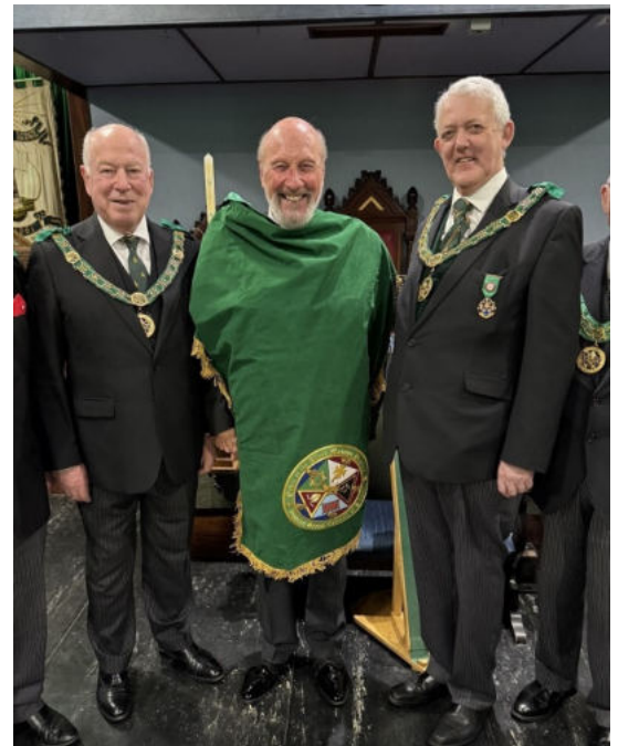
The District Grand Prefect modelled the new Sussex AMD napkin.....