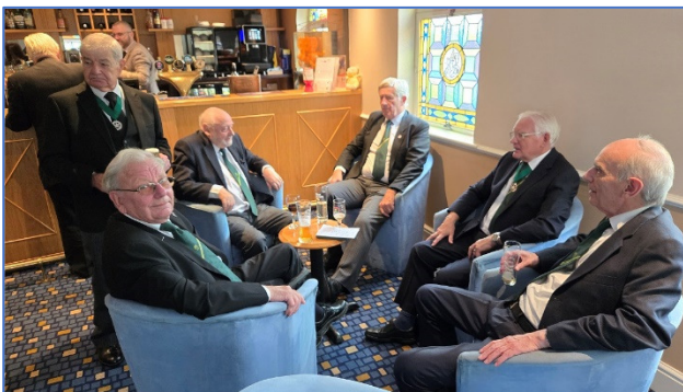
The Lodge of St Lawrence the Martyr was closed and after the usual photographs We repaired to the bar, benefited from the “traditional” sausages, and were soon in our eating area.