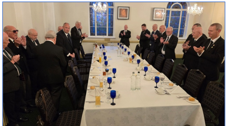
Some thirty of us sat down to a good repast, typical of the standards which are part of the Surbiton experience. The meal was readily adapted by the management for those six or so people who were not too keen on the salmon which was beautifully served. Yes, there was the palate clearer and a good dessert and then it was time to go home.