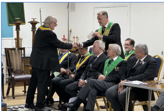
The Lodge was closed and after photographs the Brethren of Surrey Council and their many guests retired for refreshments before sitting down to an enjoyable meal together at the Croydon Masonic Hall.

The Master thanked all involved in the ceremony and the District Grand Prefect welcomed them into the Order and presented the candidates with booklets on the Order and an AMD napkin.