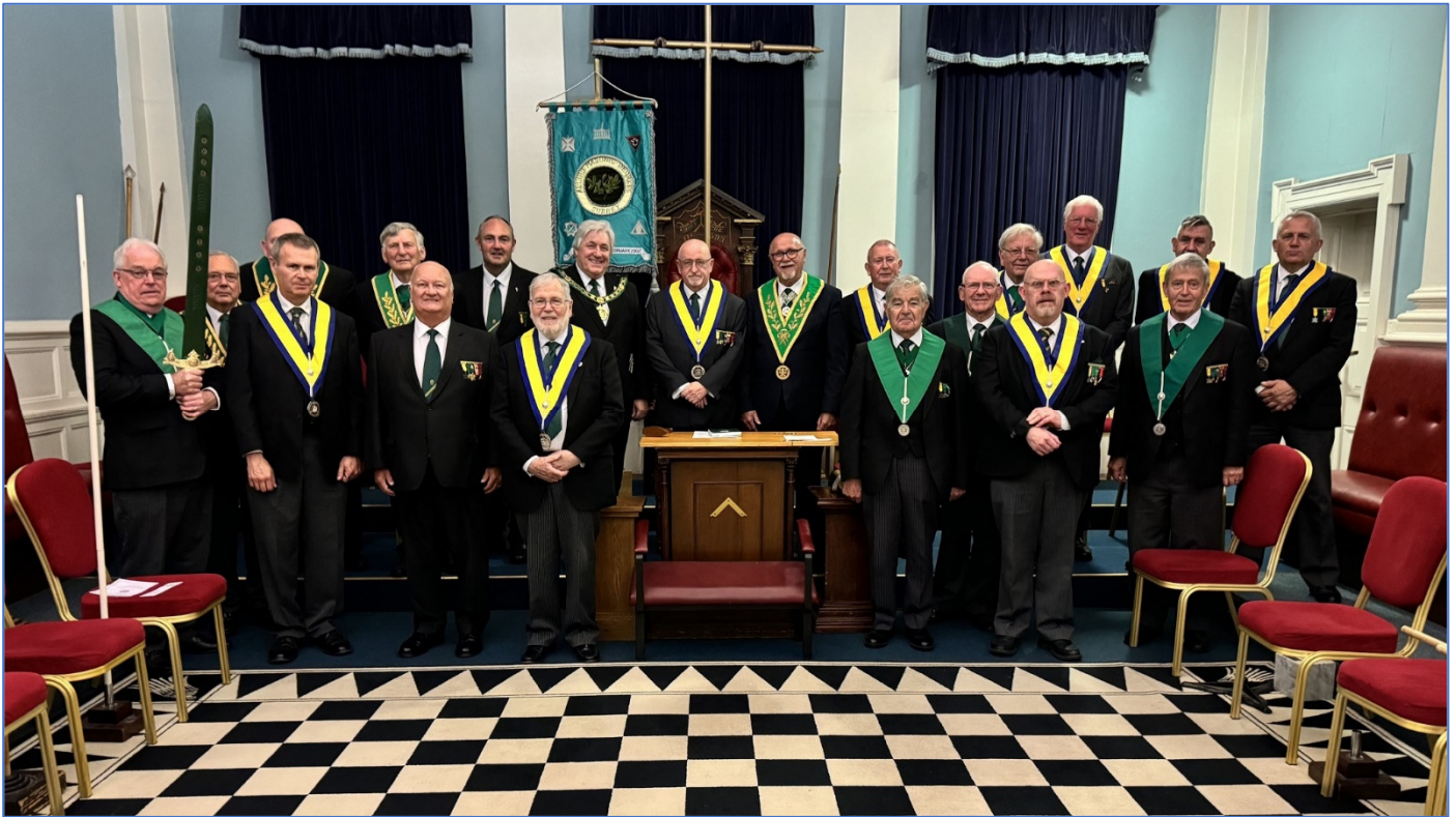
The Council was closed and after refreshments in the bar we retired to the dining room for a most enjoyable meal together.