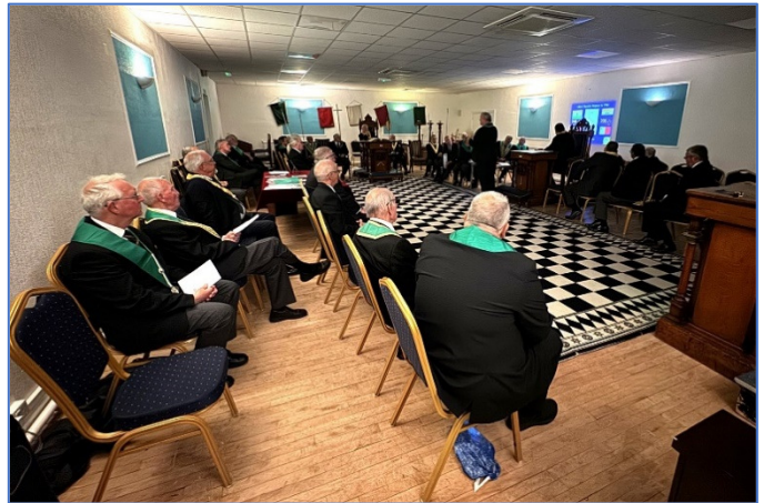
A cheque for £200 for "Man Van" cancer charity was presented to the District Grand Prefect, who thanked the Council.