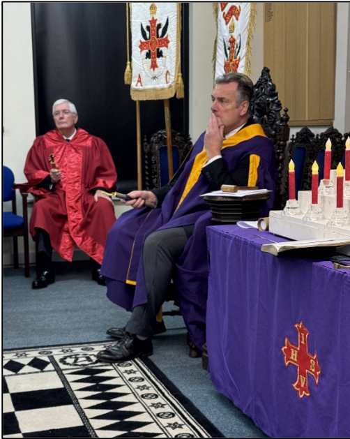
The Conclave was closed and, after the usual photos were taken, we retired to the bar for refreshments.