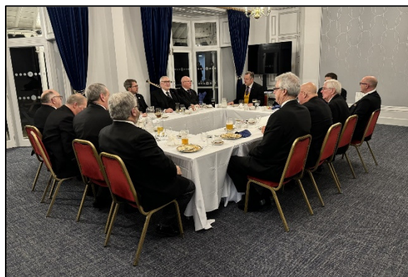
The Worthy Knights of the Emperor Constantine Conclave and their guests then sat down to a most enjoyable meal together at the Nutfield Masonic Centre.