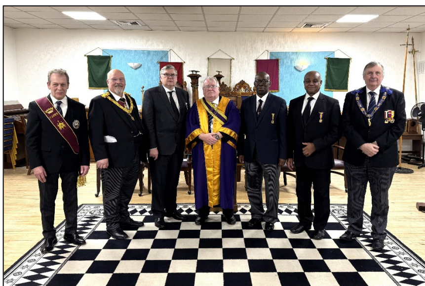
The Conclave was then closed, and after photographs we retired to the bar for refreshments before sitting down to a most convivial meal at the Croydon Masonic Hall.